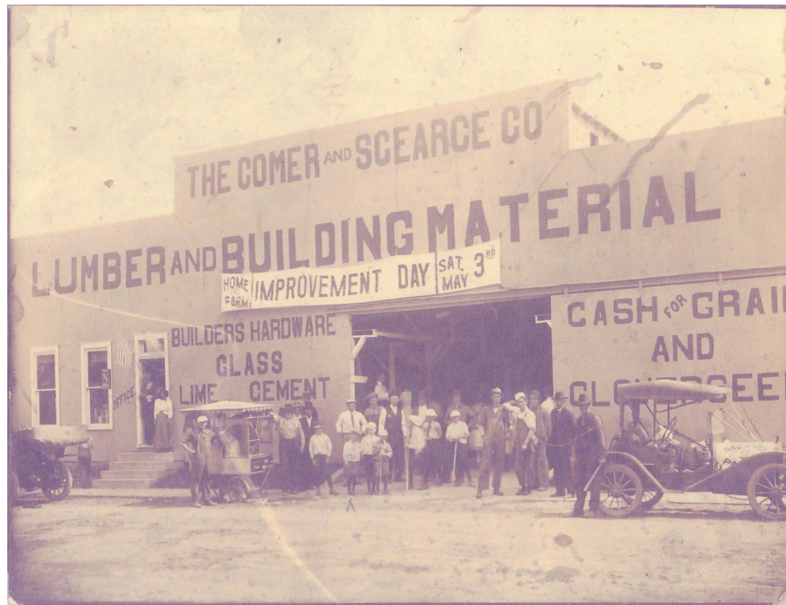
Comer & Searce Lumber Company, Mooresville, IN (1902)