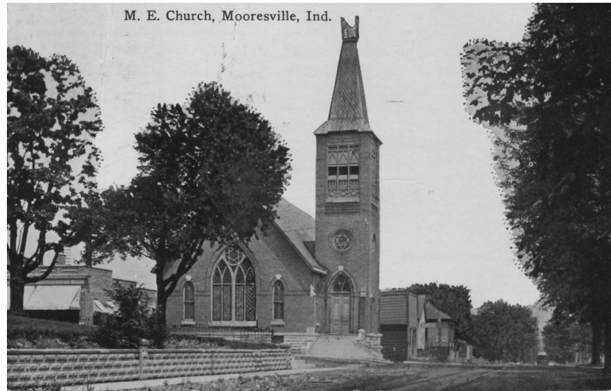
1914 View of Methodist Episcopal (M.E.) Church (1882-1995) Northeast Corner of Indiana & Harrison Sts., Mooresville, Indiana