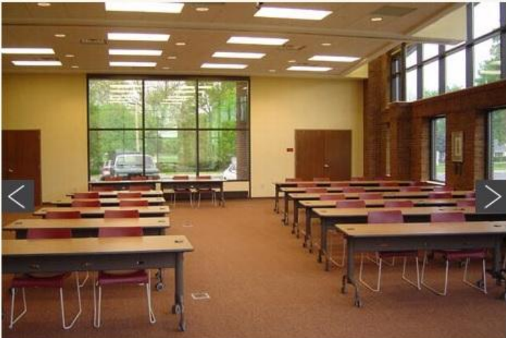
Call (317) 831-7323 to reserve the Bonita C. Marley Community Room.