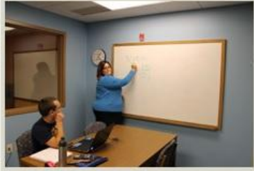
The library's study rooms are ideal for tutoring students.