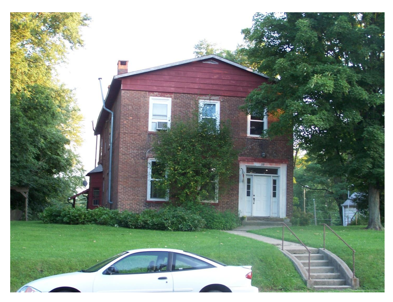
Figure 3. The Conduitt-Moore house at 35 West High Street as it appeared in 2009.