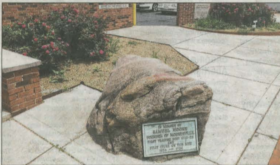
The stone and plaque honoring town founder Samuel Moore once sat at the intersection of Indiana and Main streets. It was moved for construction on Bicentennial Park and its possible relocation became a topic of conversation at a Mooresville Town Council meeting in September 2017. (File photo)

Then, in January 2018, the stone was returned to the downtown area and located near the back of the park, close to the Citizen's Bank parking lot.