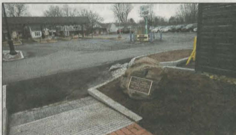
Before being moved to its current site, the Samuel Moore Founder Stone was placed at the back of Bicentennial Park near Citizen's Bank.

Last week, employees from the Mooresville Street Department moved the stone from the back of Bicentennial Park to the Indiana and Main streets intersection.