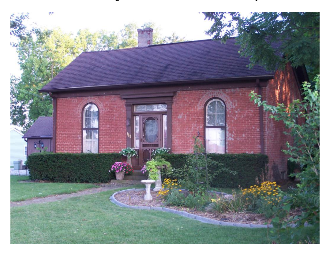
W. K. Thompson House, 103 E. High St.: Side-hall plan, Italianate style, circa 1875.