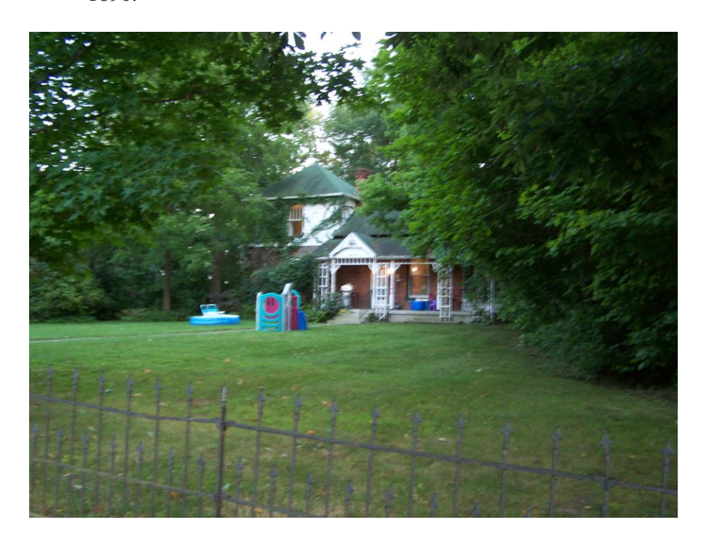
#12 Former Site of Matthew Comer House, 218 E. South St.: Italianate style, circa 1870. Torn down—current house built after fire in the 1990s.