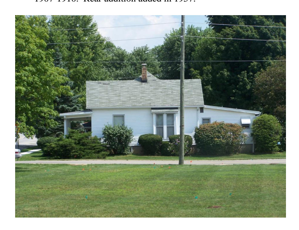
House, 224 W. High St. (directly across from intersection with Lockerbie St.): Italianate style, circa 1870.

House, 155 W. Main St. (SE corner of intersection of W. Main & S. Monroe Sts.). Built before 1885 and situated in downtown Mooresville at 5 East Main Street (on front of lot). Moved to 155 W. Main St. between 1907-1910. Rear addition added in 1957.