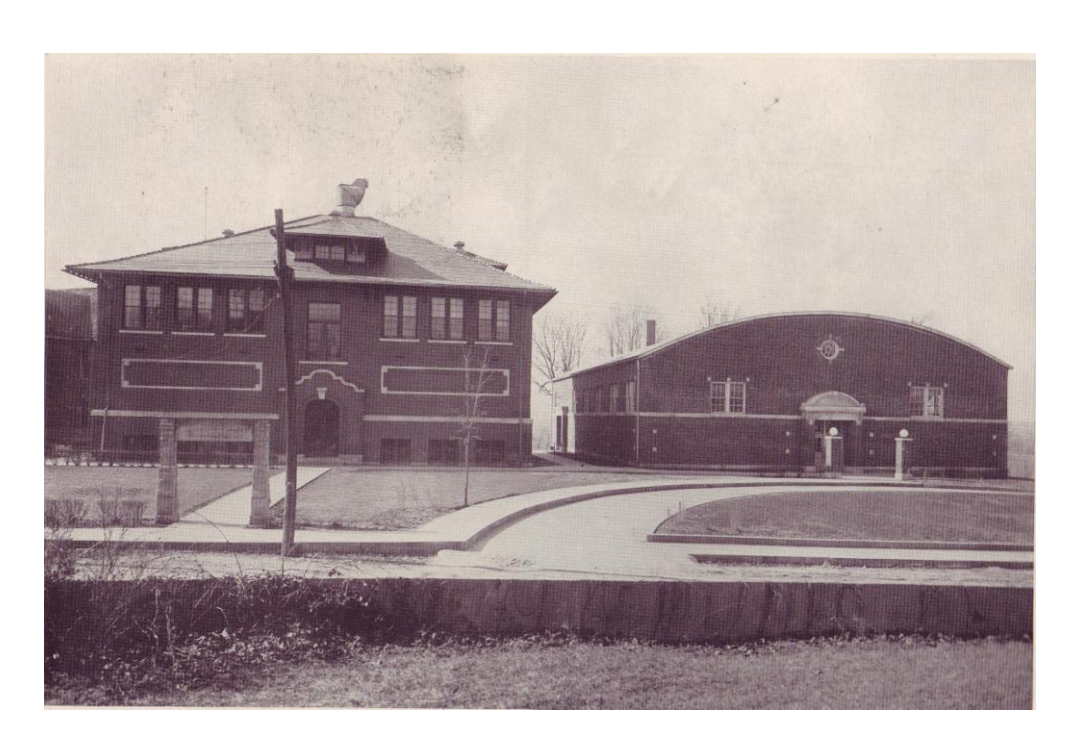
#32 Mooresville Friends Academy School, 244 N. Monroe St., 1861. First high school in central Indiana.

#31 Old High School Gymnasium (on right), 244 N. Monroe St., 1921 (Old MHS on left).