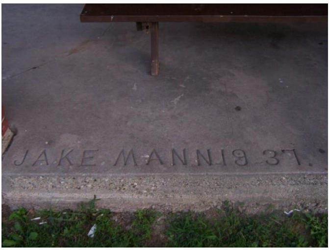
Boy Scout Cabin, Old Town Park, E. South St.: Single-pin log construction, circa 1932.