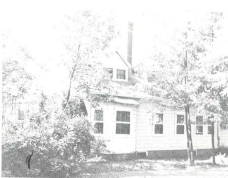
First House, West End of South Street