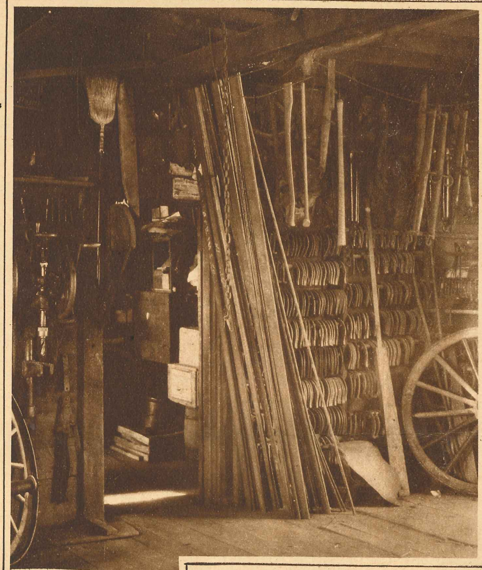
Since the automobiles have gone far into the lead, horseshoes are principally used nowadays in pitching contests. (Hohenberger.)