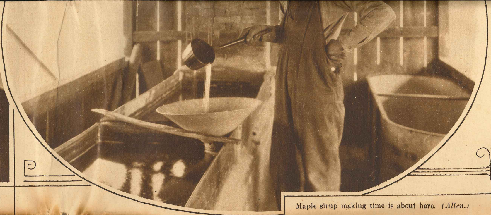
Maple sirup making time is about here. (Allen.)