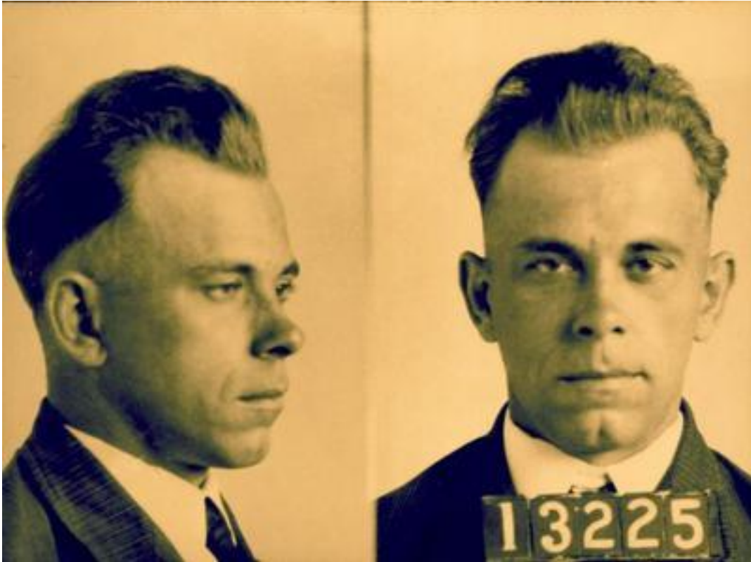
John Dillinger Mug Shot (ca. 1924)