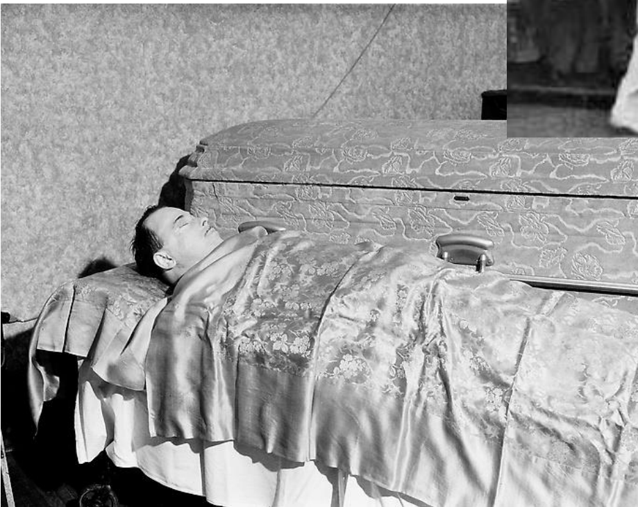
(Left) John Dillinger's body at Harvey Funeral Home in Mooresville (July 25, 1934)