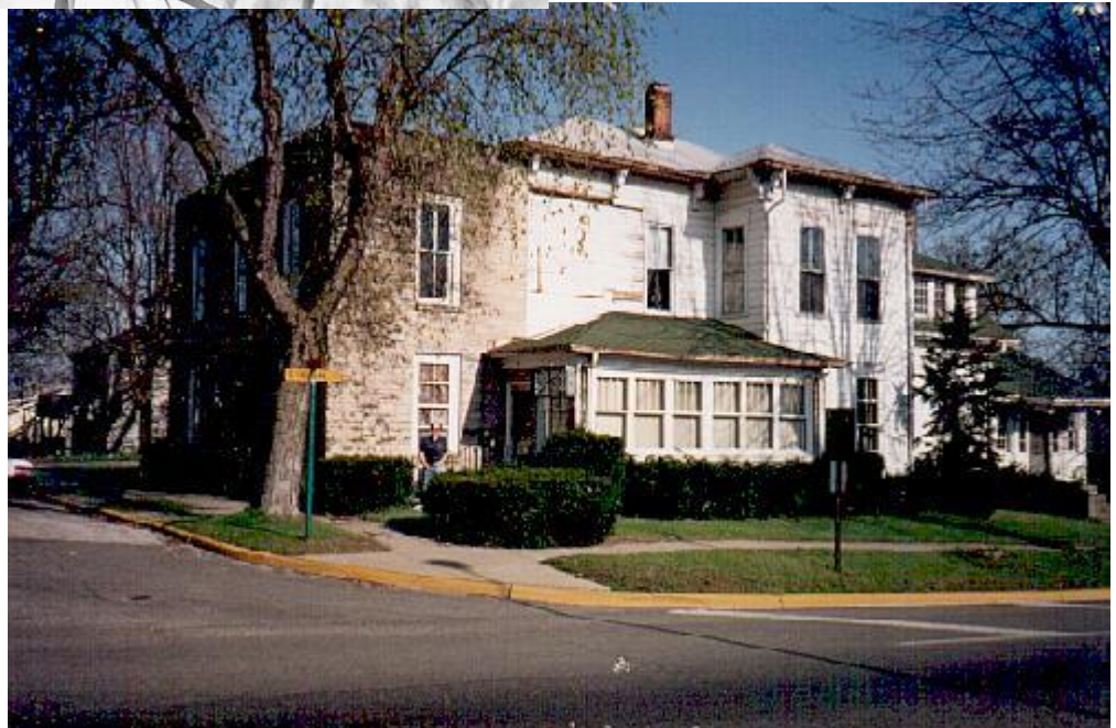
(Right) Harvey Funeral Home was on the southeast corner of South Indiana & East Harrison Streets in Downtown Mooresville