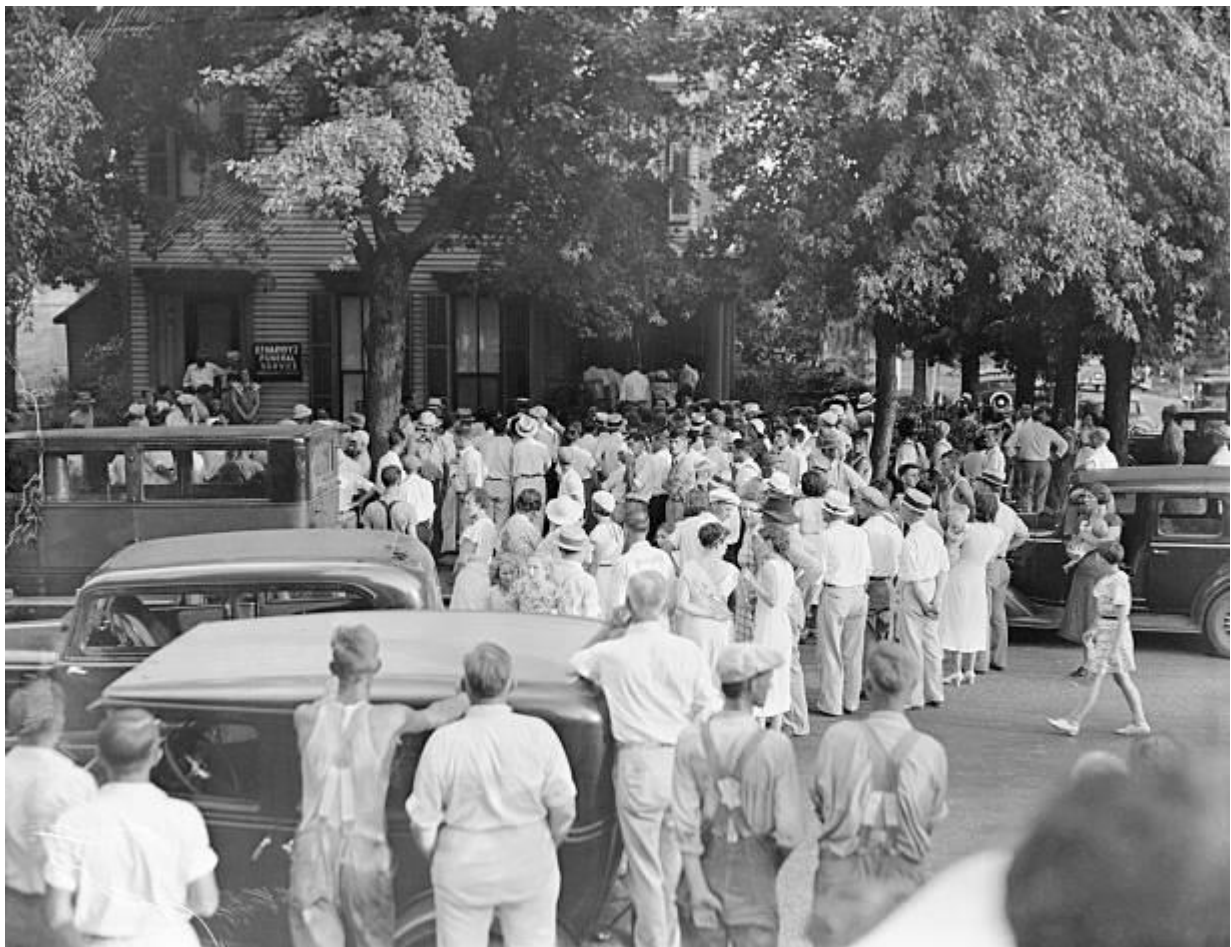
(Above) Hundreds braved the 103° F. heat wave to see John Dillinger's body at Harvey Funeral Home on July 25, 1934. The line of onlookers circled the block twice. (Below, Right) John Dillinger was born at 2053 Cooper Street in Indianapolis.