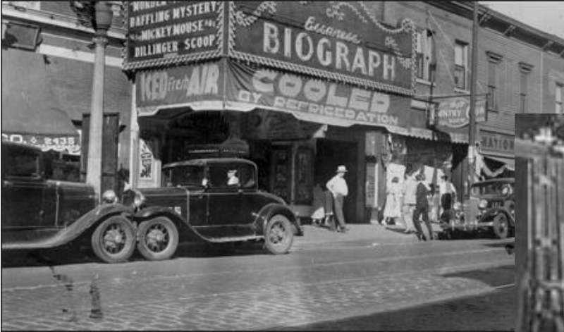
(Left) Biograph Theater, Chicago (1934)