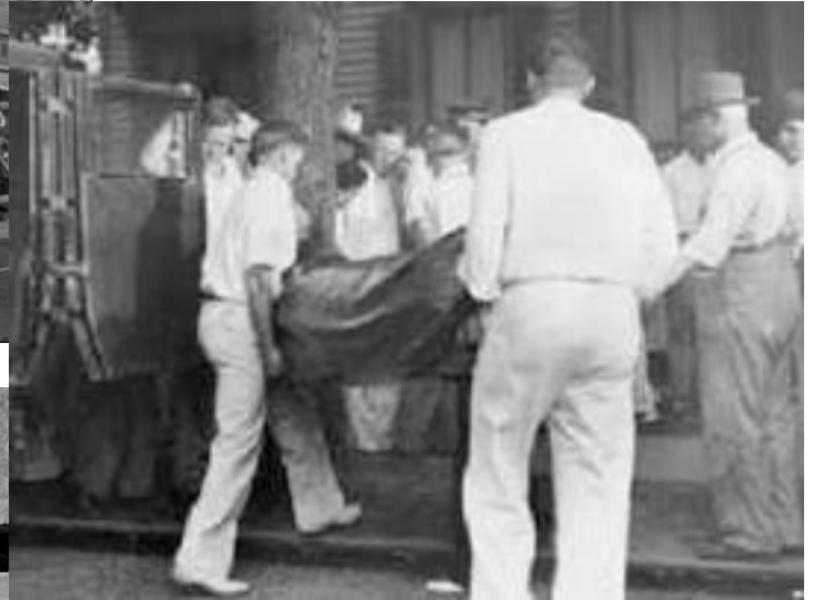
(Above, Right) John Dillinger's body being unloaded at Harvey Funeral Home