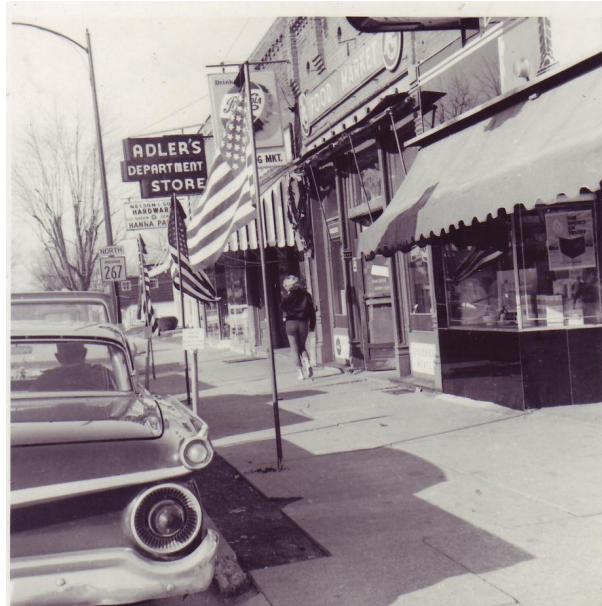
North Side of West Main Street Mooresville, IN (Mid-1960s)