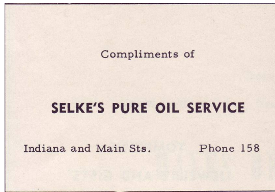
Figure 4d. Selke's Pure Oil station ran this advertisement in the 1955 Mooresville High School Wagon Trails yearbook.