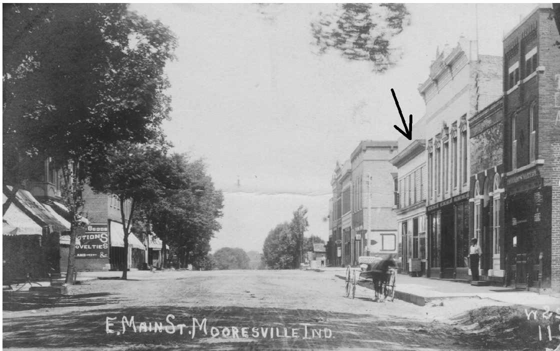
Figure 2A. Looking toward East Main Street (and the intersection of Main and Indiana Streets) from West Main Street. The arrow marks the Lindley Block.