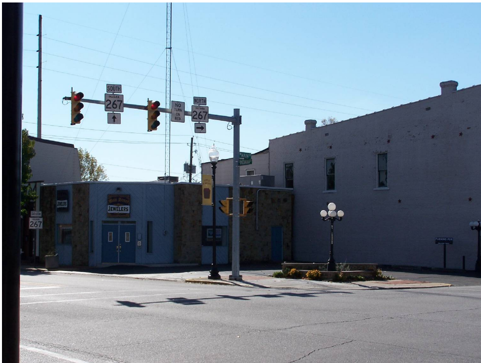
Figure 5. Site of the Lindley Block (and, later, gasoline service station) on the southwest corner of the intersection of Main and Indiana Streets, Mooresville, IN (November, 2007), which subsequently housed various retail businesses, including the jewelry store above.