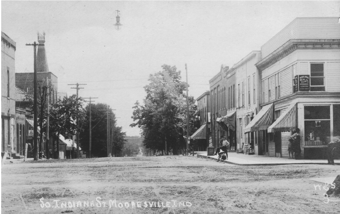
Figure 2. South Indiana Street, looking across the intersection of Main and Indiana Streets, during the 1910s. The Lindley Block is on the right.