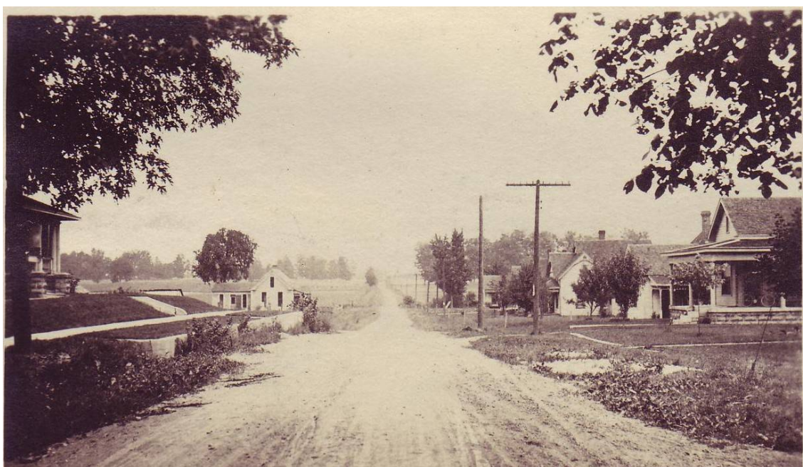
North Indiana Street at Morgan Street and beyond (early 1900s).