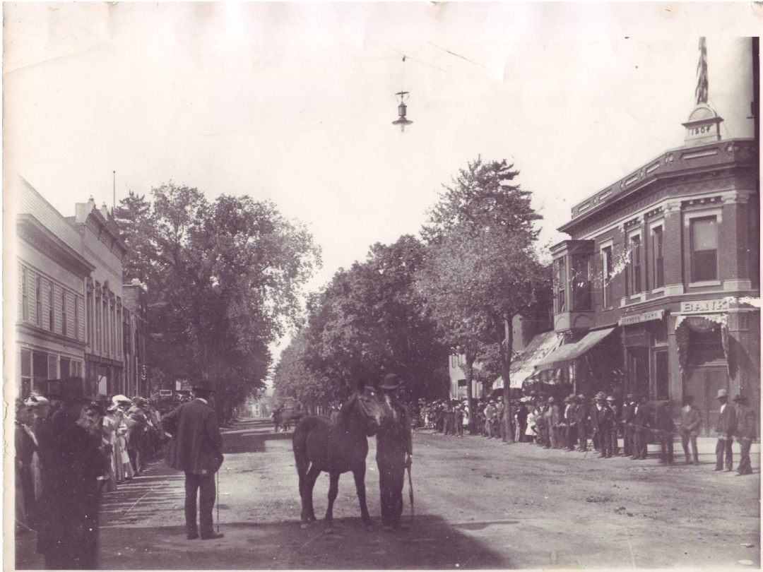
(ABOVE) Main Street, looking west from Main St/Indiana St. intersection (1910), during the 1910 Horse Show. Farmers State Bank (right), Lindley Block (left). (BELOW) South Indiana Street from Main Street intersection ( circa 1915)