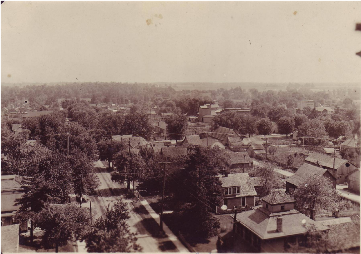
Aerial view of Mooresville, looking southeast [ABOVE] & southwest [BELOW] at Harrison Street from M.E. Church Steeple (1920)