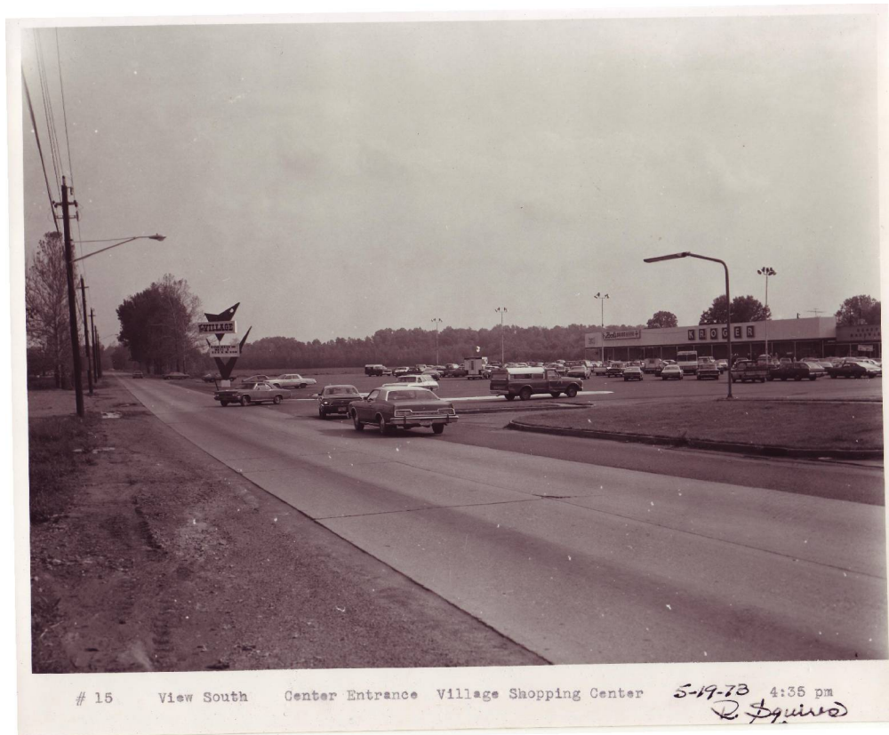
South Indiana Street at Village Shopping Center, looking south [ABOVE] and east [BELOW] (5/19/1973).