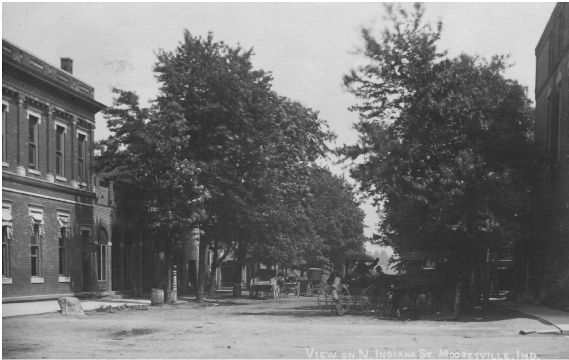
(ABOVE) North Indiana Street from Main Street intersection (1912). (BELOW) View from Washington Street looking south on North Indiana Street (circa 1910)