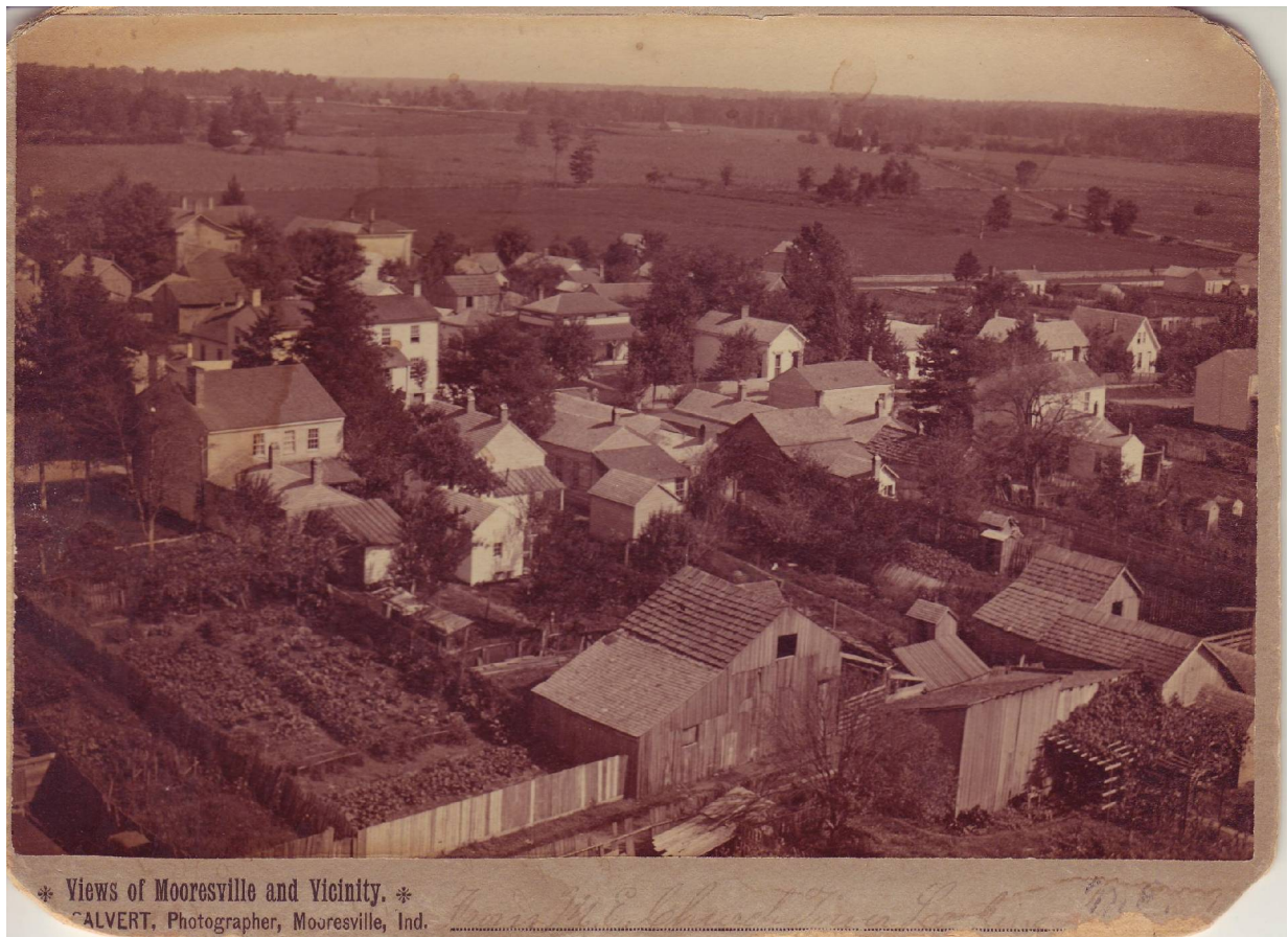
(ABOVE) Aerial view of Mooresville, looking northeast from M.E. Church steeple, circa late 1880s/early 1890s. (BELOW) Main Street Looking West From Indiana Street Intersection (early 1900s).