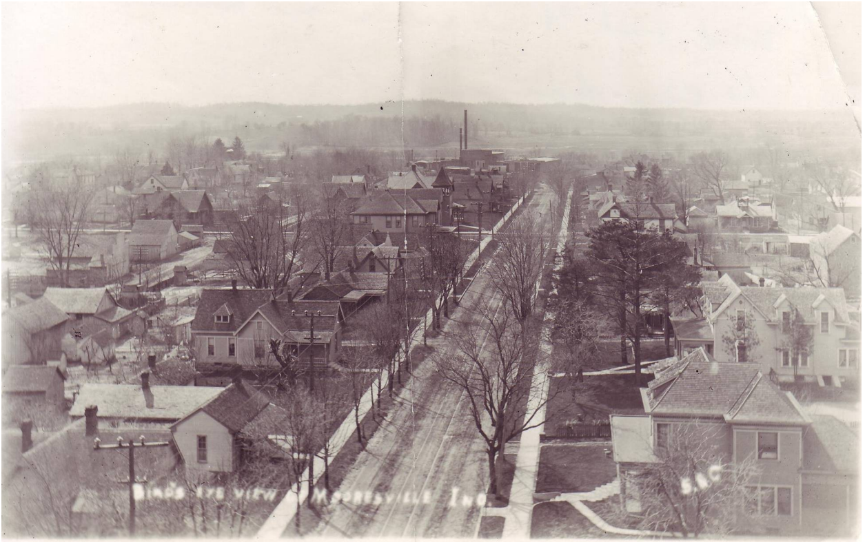
(ABOVE) Aerial view of Harrison Street, looking west [taken from Methodist Episcopal (M.E.) Church steeple, circa 1910]. Interurban railway tracks ran along Harrison Street to the railway's (and the town's) electric power station and car storage barns. The Christian Church steeple is visible just above the center (before the power plant chimneys). Mooresville Public Library is now located where the street ends in the picture (on the north side). (BELOW) East Main Street (early 1900s)