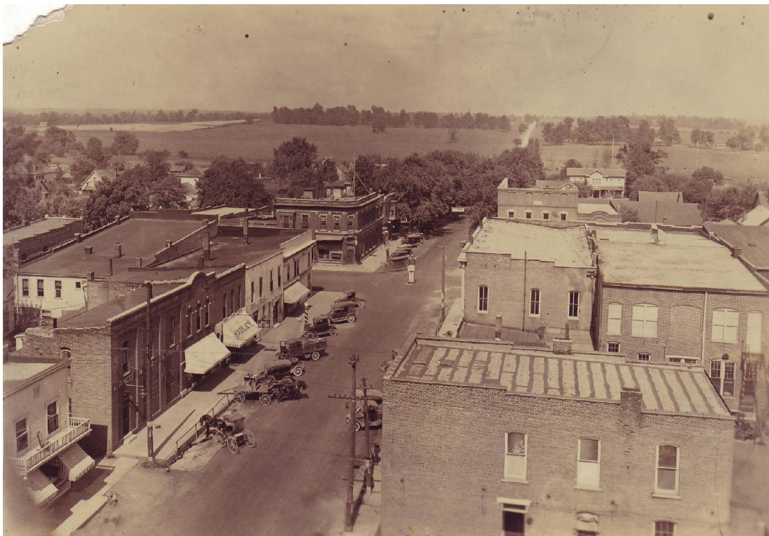
Aerial view of Mooresville, looking north [ABOVE] and south [BELOW] at Indiana Street from M.E. Church Steeple (1920)