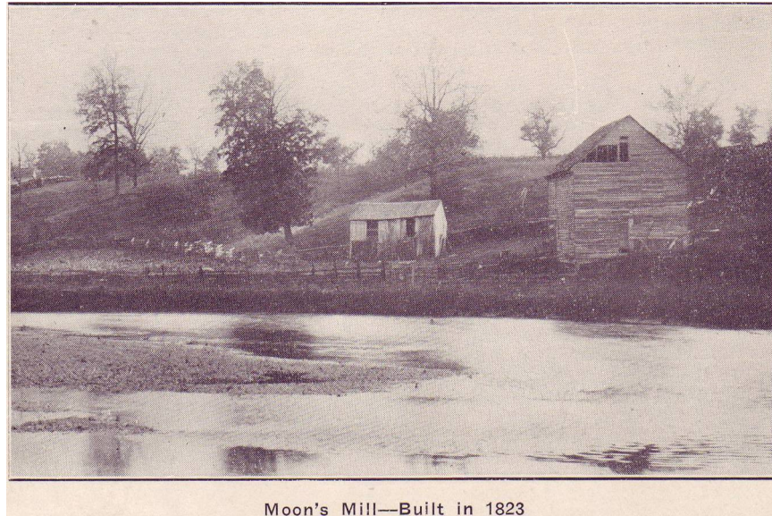
Moon's Mill—Built in 1823

Moon's Mill (circa 1900), along the White Lick Creek, near present day Kroger grocery and Gray Brothers restaurant.