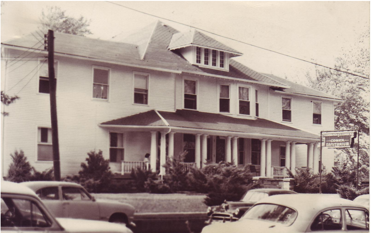
Comer Sanitarium (late-1940s)