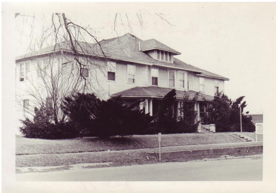
Former site of Kendrick Hospital, following conversion into business & apartment space in 1973 (above photo date: July 19, 1976). See also Mooresville Times, Jan. 11, 1973 article (next page).