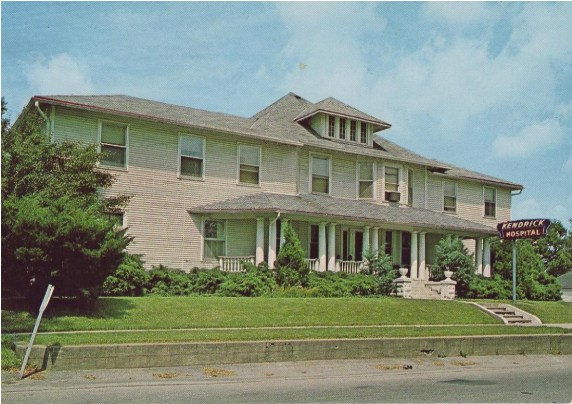
Kendrick Hospital (postcard, early 1960s)