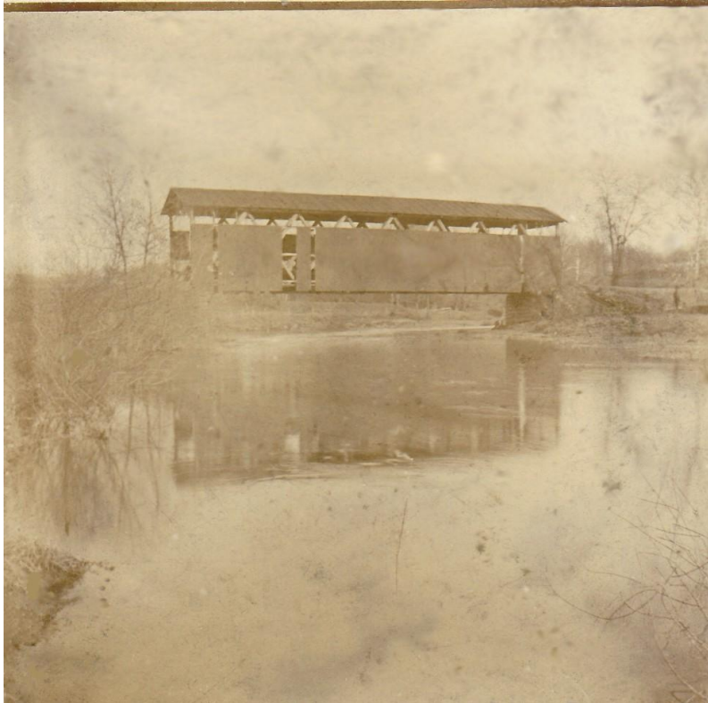
“Old Red Bridge” Across the East Fork of White Lick Creek (circa 1910-1915)

In September, 1915, the Morgan County Council appropriated $1,025 for a new bridge “on the Mooresville & Waverly road in Brown Township, known as the Red Bridge.” No construction proposals were received at the October, 1915 meeting, and nothing further appears to have been done during the next couple of years.