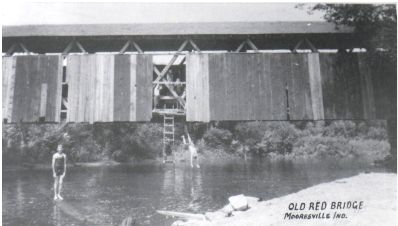
"Old Red Bridge" Across the East Fork of White Lick Creek (circa 1910-1915)