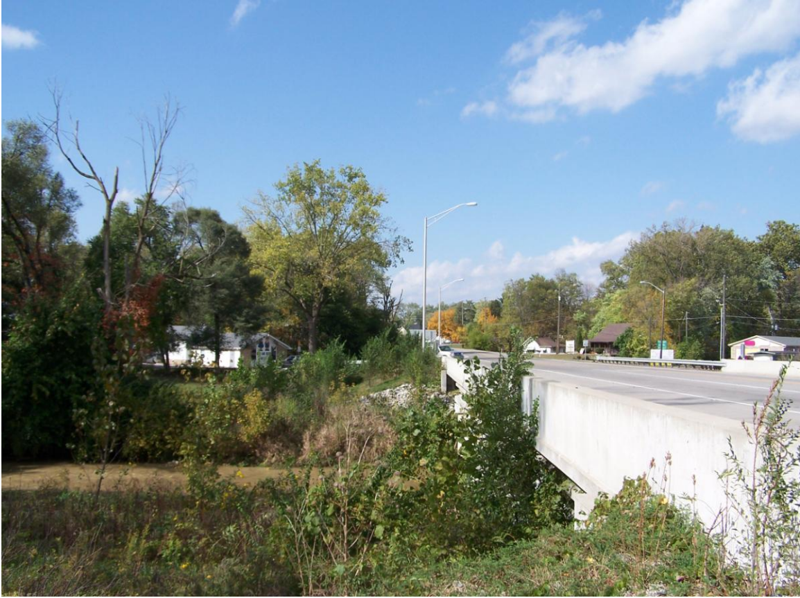
East Fork of White Lick Creek at the East High Street Bridge, Mooresville, IN

(See photo at the top of the next page.) Looking east across the bridge, one sees a Wendy's restaurant close to where Day's Hill (and homestead) once stood. The hill was bulldozed, and the dirt was removed to fill the lowland adjacent to the East Fork of White Lick Creek, where a bank, realtor, and gas station now stand, on the southwesterly side of State Road 144.