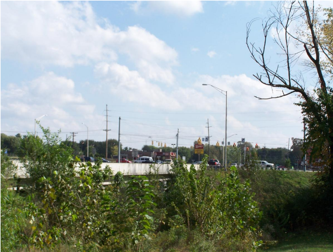
Looking East Across the East High Street Bridge at the Intersection of State Roads 67 and 144, Mooresville, IN